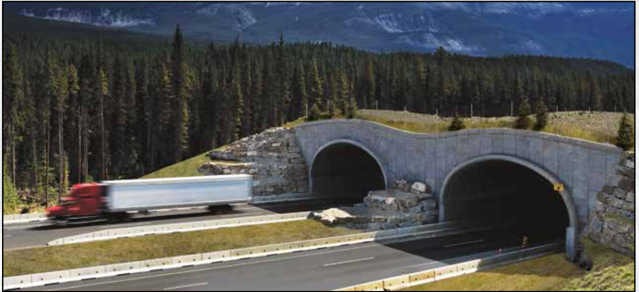
Figure 4 – DCSP Underpass with Splash Walls, Concrete Collars and End Walls