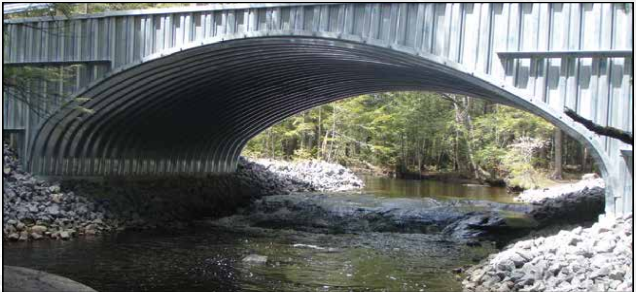
Figure 3 – BSS Box Culvert Bridge on Footings (Includes Steel Sheet Pile Headwall)

Options for the protection of plate structures with shallow cover from roadway contaminants infiltrating the overburden and coming into contact with the shell include: