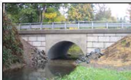
PIPE-ARCH CULVERT WITH BURIED INVERT ON WATERCOURSE