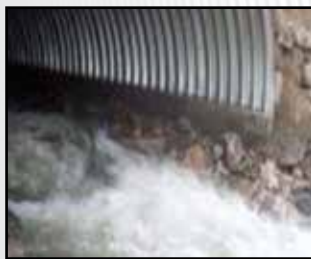
OPEN BOTTOM ARCH ON WATERCOURSE