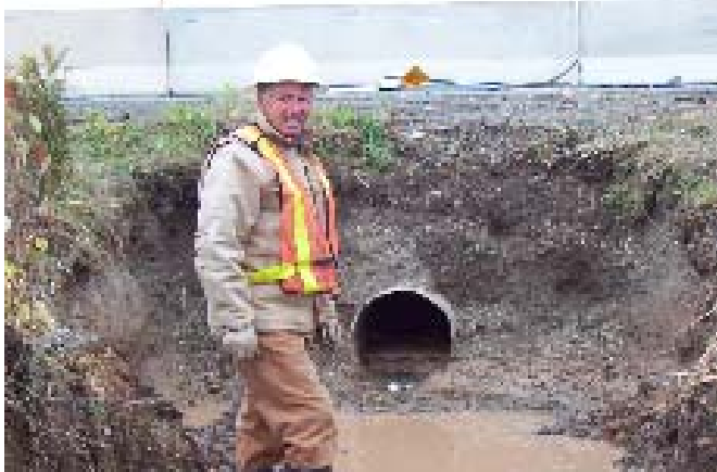
Culvert Silted with De-Icing Salt & Sand

Replacing deteriorated culverts and storm sewers under a heavily traveled roadway or deep fill can be an expensive and disruptive operation. The detouring of traffic required for conventional reconstruction can create significant costs and public inconvenience. Relining with corrugated steel pipe will minimize project cost and time. Access is restricted in smaller diameter pipes so all cleaning, pipe insertion, coupling and grouting is done from the pipe ends or access points. Long lengths of strong, rigid, securely coupled CSP are ideal for this procedure. Designed to carry the full load above the pipe the total wall thickness of CSP remains relatively thin to optimize effective end area for maximum flow capacity.