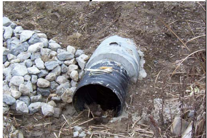
Polymer Laminated CSP Reline Pipe Fully Grouted