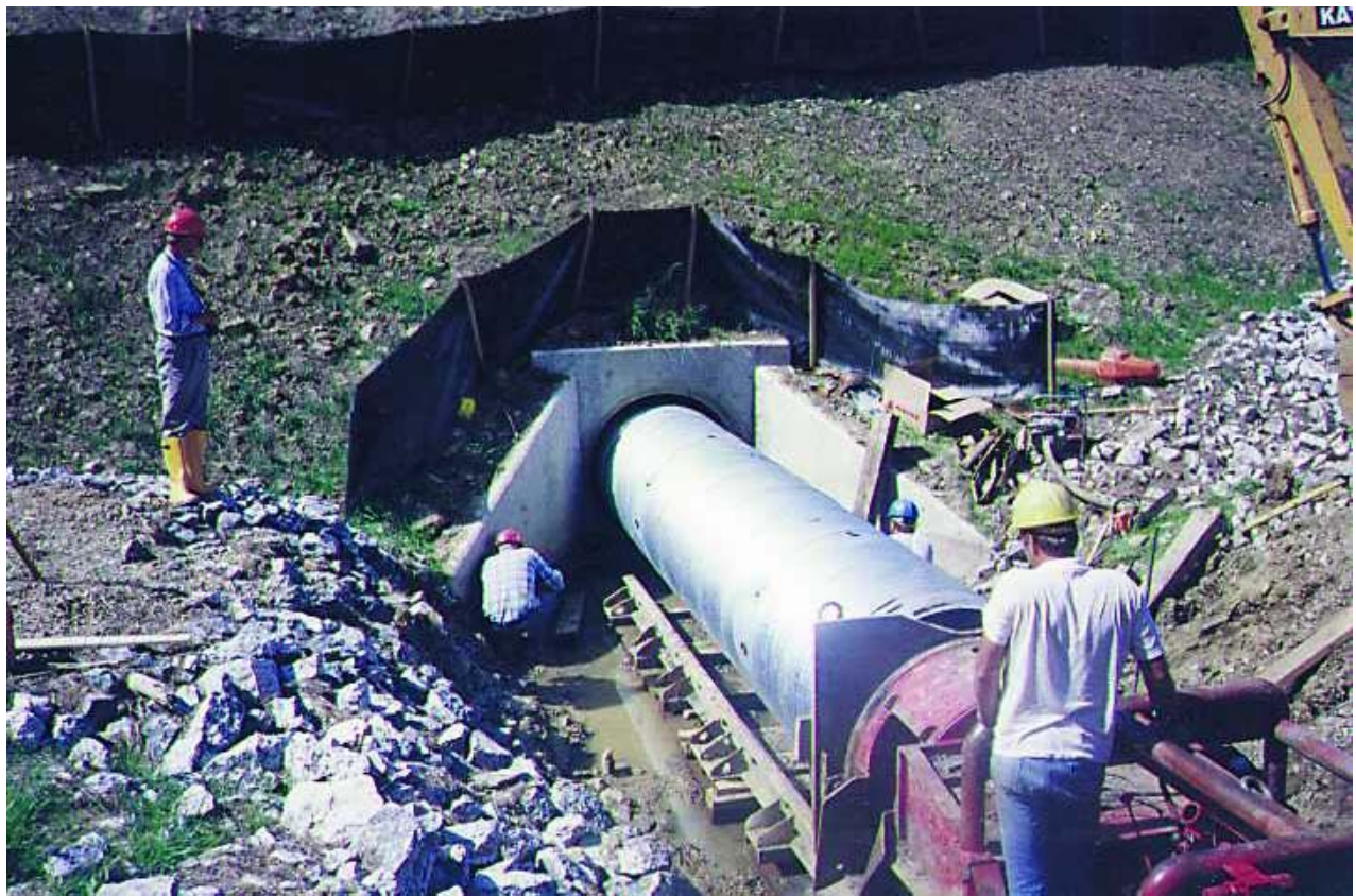
JACKING CORRUGATED STEEL PIPE INTO CONCRETE PIPE HIGH FILL REPAIR SITUATION